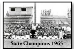
State Champion $1000+