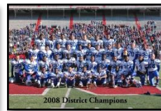
District Champion $500 - $999