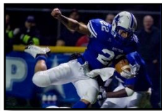
First Down $25 - $49