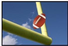
Field Goal $50 - $99