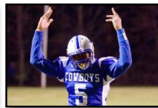
Touchdown $100 - $499