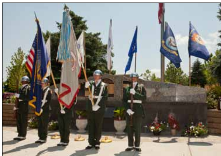
A ceremony will be held on Saturday (July 27) at the Boys Town Veterans Memorial.