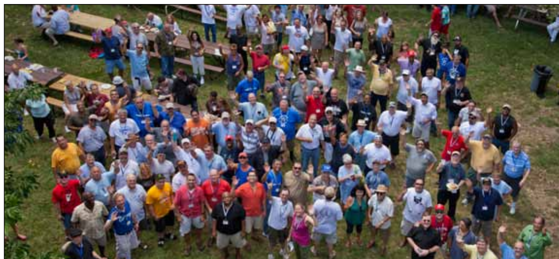
A large group assembled for the Sunday picnic at the last Biennial Convention in 2011.

As far back as the early 1940s, Father Flanagan had a goal to form an active and formal Boys Town Alumni Association. This summer, July 25-28, 2013, will mark the 31st Biennial Convention of the Boys Town National Alumni Association®, and it promises to be a great weekend of reunion, renewal of friendships, and a return of alumni to the home of their youth.